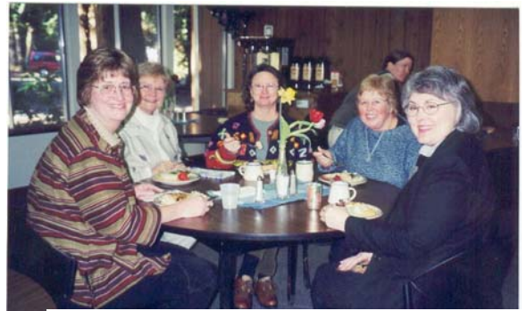
Women's Retreat at The Cedars

This study group explores the meaning and implications for our lives of the healing encounters recorded in the Gospels. The group, through rotational leadership, utilizes a study guide prepared by the International Order of St. Luke. We meet on the 2nd and 4th Tuesdays of the month from 1:00 to 2:30 in the Guild Room. Drop in participation is welcome.