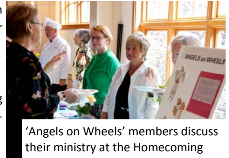
'Angels on Wheels' members discuss their ministry at the Homecoming Sunday Ministry Fair.

The members of Angels on Wheels provide a week's worth of meals to those undergoing surgery or other short-term medical situations. Volunteer members rotate meal preparations.