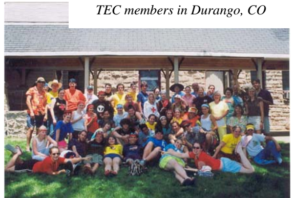
TEC members in Durango, CO

2010 marked our 27th TEC weekend here at Christ Church and our 34th in total as we have helped start programs in Mercer Island, WA; Bend, OR; Reno, NV; Moab, UT, and Durango and Grand Junction, CO.